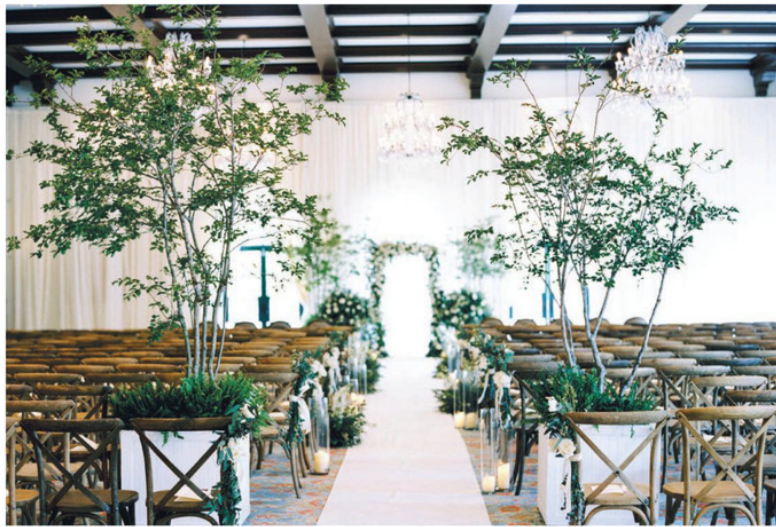
Clockwise from top: Jules and Brendan used Sea Island's beach as the backdrop of their big-day photos; The Vine delivered when it came to florals, especially with this photoworthy hedge wall; the nature-inspired aisle included petite trees at the entrance; Georgia Ann's Paperie provided elegant invitations, while Paper Daisies Stationery supplied guests with gorgeous programs. Opposite page: The two tied the knot at The Beach Club at Sea Island, which offered tropical elements to their special day.